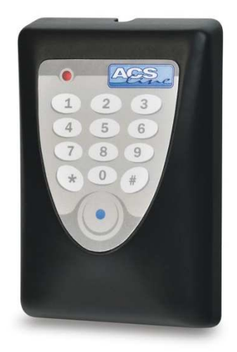
We prepare a new version to be launched in fall 2009.